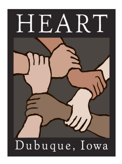
Figure 1 Dubuque's HEART program partners with schools

Livable Communities" award in 2010. As the city of Dubuque continued to develop and become more of a sustainability-minded community, it became increasingly import to the entire county to address this potential threat of lead to young children. Similar connections could be made in Davenport to local sustainability initiatives.