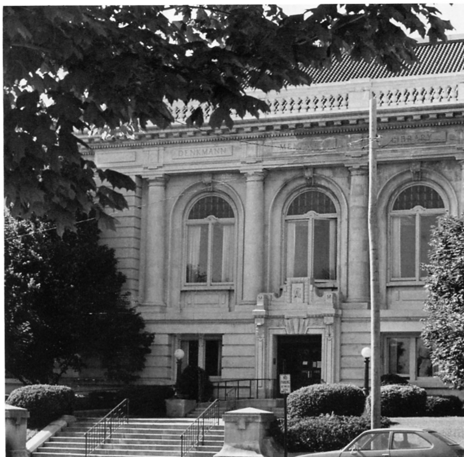
The Swenson Center is housed on the third floor of Denkmann Library on the Augustana College campus.

Genealogy classes. This spring, the Center opened its doors in the evenings to some 20 persons armed with notebooks, pens, and Swedish ancestors.