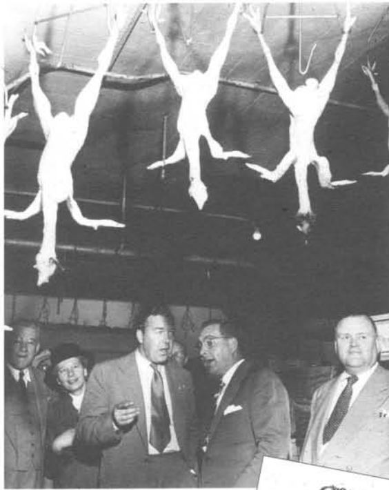
Right: Articles from Swedish-American newspaper in the 1950s and 1960s. Above: Swedish delegation from the 1948 Swedish Pioneer Immigration Celebration visits Swanson and Sons Poultry Factory in Omaha, Nebraska.

This pattern of coverage continued when a crisis in diplomatic relations between Stockholm and Washington occurred. Sweden's diplomatic recognition of Hanoi in 1969 and Prime Minister Olof Palme's 1972 comparison of U.S. bombing to Nazi atrocities prompted the U.S. to withdraw its ambassador to Stockholm. Alarmed by possible unpleasant repercussions, the Foreign Ministry worked to get a new envoy appointed. These efforts included distributing news portraying Sweden as the aggrieved party. The Foreign Ministry distributed articles such as "We Want Intimate Contact With USA" and "Freeze Not Sweden's Wish," which appeared in Nordstjernan and "Fascist Greek Junta Gets Blessing, Democratic Sweden Gets Punished," which appeared in Svenska Posten . The Foreign Office also distribu-