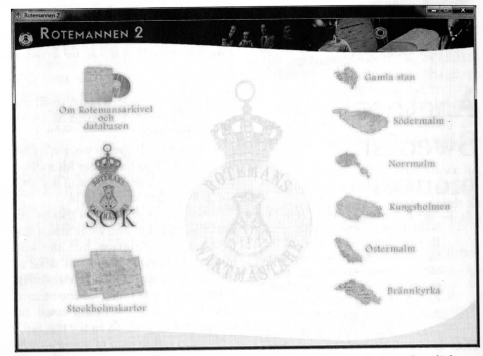
To search just click on SÖK, and then fill in the person details. Only in Swedish. Rotemannen 2 is available for both PC Windows and Mac.

Instead, the city started a system with a special clerk ( rotemannen ) in each block that had as his duty to keep tabs on everyone in the block. He noted in big ledgers all the people moving in and out, and where they came from, and where they went, and also dates and places of birth, occupations, and even if a poor girl needed a new pair of shoes. Most of these records have now been digized, but there are still gaps. The databse is expected to be complete in 2017. It now has 5.7 million people.