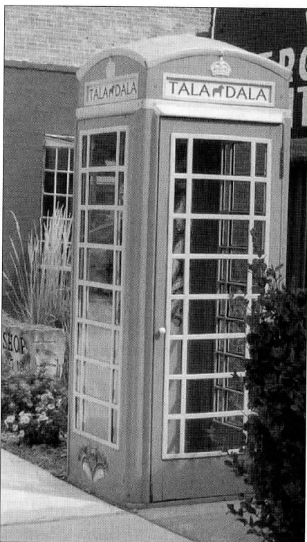
A phone booth on Main Street.