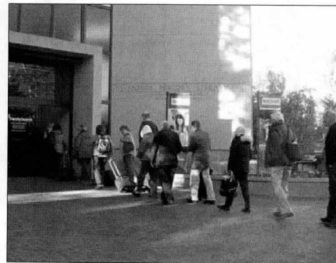
The early morning line when the FHL opens.

We look forward to seeing old and new friends in our happy group of researchers !