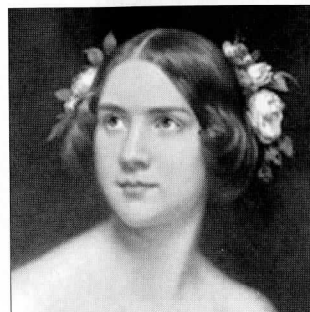
Jenny Lind (1820-1887).

Here are the display cases, with new texts.