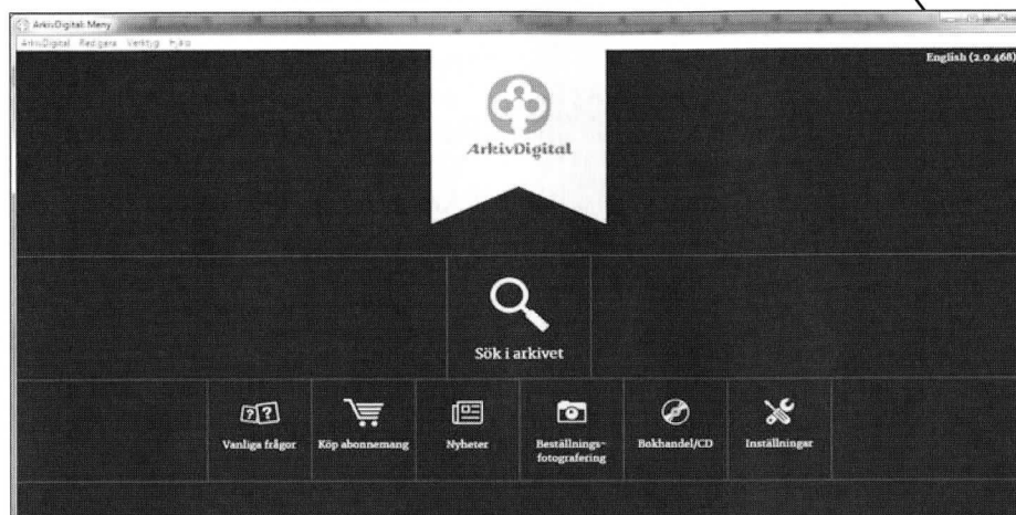
Picture 1. The start screen.