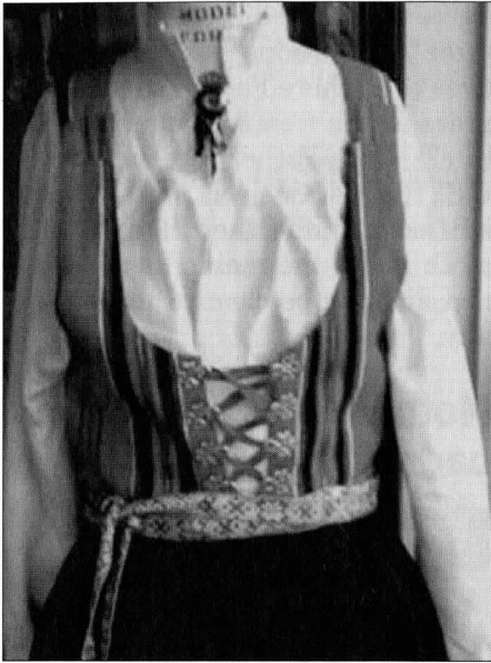
Vest and blouse.

round the neck and cuffs. The cuffs are closed with handmade buttons. The measurements are: approximately 15 inches across – approximately because there are not any shoulder seams – and 15 inches from neck to bottom of blouse which would reach just below the bust.