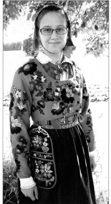
Girl in Floda costume.

This is a traditional costume from Floda parish in Dalarna. It is beautiful!!! Mother must have worn it once as there is a small stain in the armpit of the blouse. Otherwise all pieces are mint.