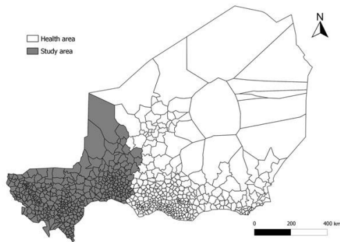
Figure1. Location of the study area, Niger. This area comprises the 379 health areas in 3 regions (Tahoua, Tillabery, and Dosso).

Refugees are responsible for internal conflict; 11,000 people have been displaced because of the conflict between government forces and the Tuareg militant group.