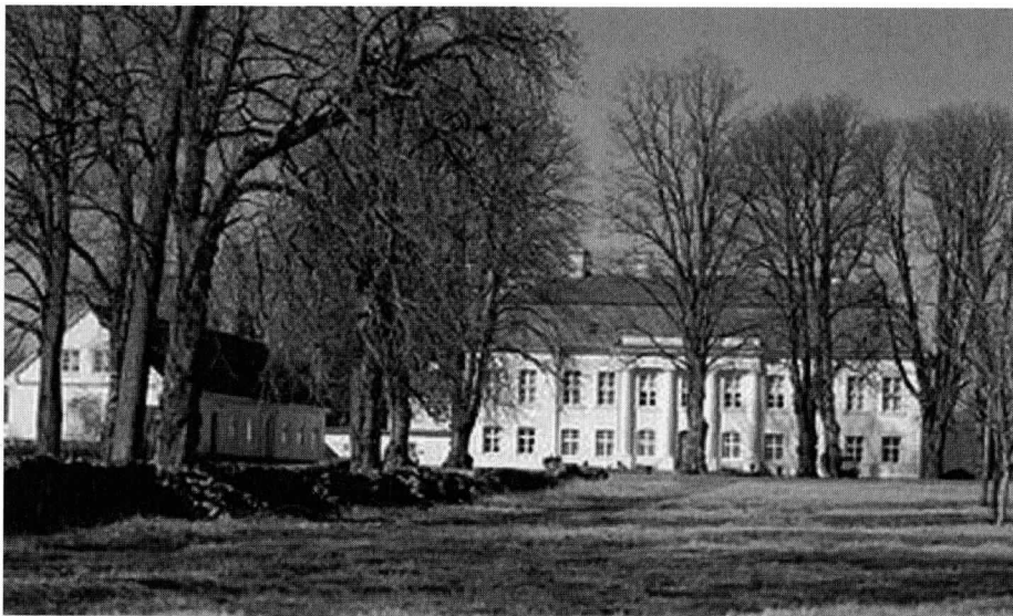
Skillinge manor, just south of Munka-Ljungby church. Built around 1780, it was a large estate with about 2500 acres of land, worked by farm laborers.