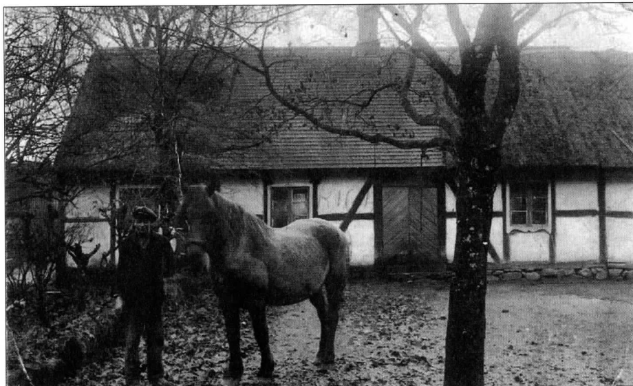
Rigatorpet in the 1930s.