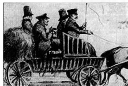
Transport of a prisoner in the 1800s.