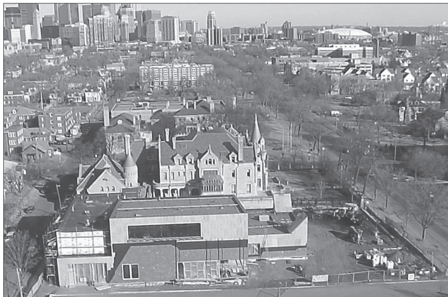
Photo from the ASI webcam 2012 Feb. 12.

So there are improvements to the old building and the Nelson Cultural Center is shaping up. Hopefully the building of it will be done by March, and then the interior needs deco-