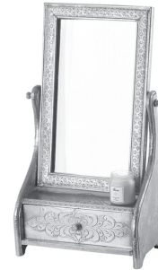
A mirror with a drawer.