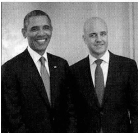
President Obama and Fredrik Reinfeldt, prime minister of Sweden.

During September 4–5 President Barack Obama visited Sweden for a meeting with the Swedish government. He also had lunch with the King and Queen, and visited the Stockholm synagogue in memory of Raoul Wallenberg. After the visit the President continued to Russia.