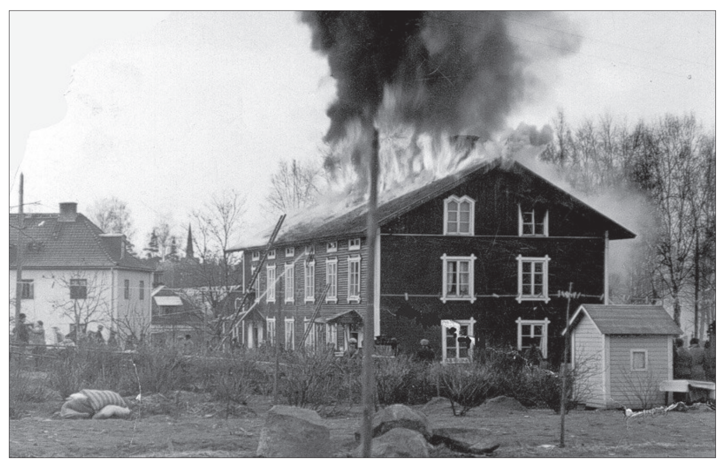
This picture shows when a house called Blinkenberg in Hagfors, Värmland, burned, but the year is not known. Hagfors was built in the 1870s, when a new modern steel works was started here, and this building was one of the first lodgings for the workers there.