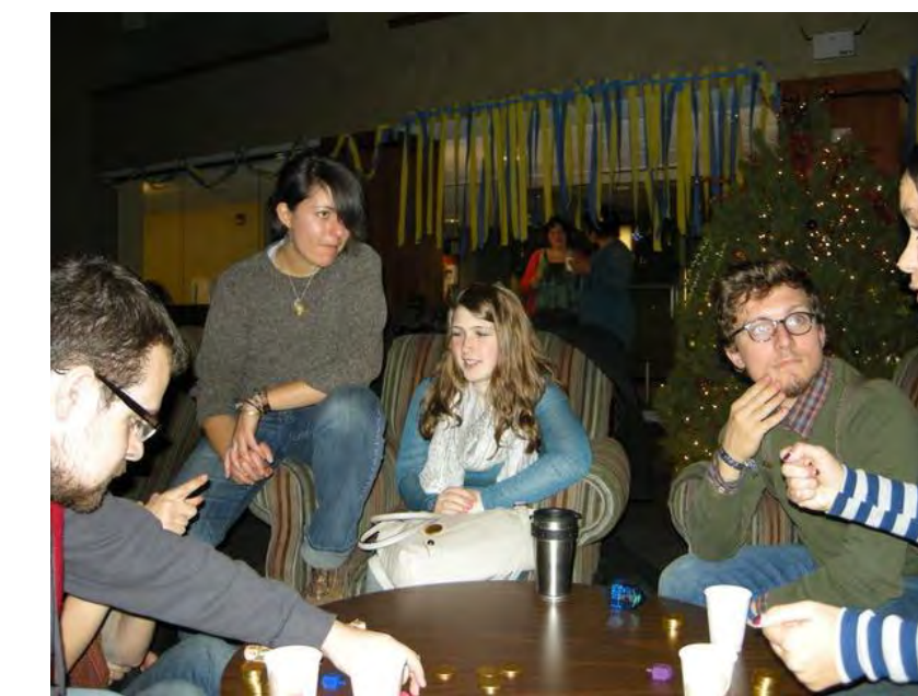
Students play Dreidel at Hanukkah celebration.