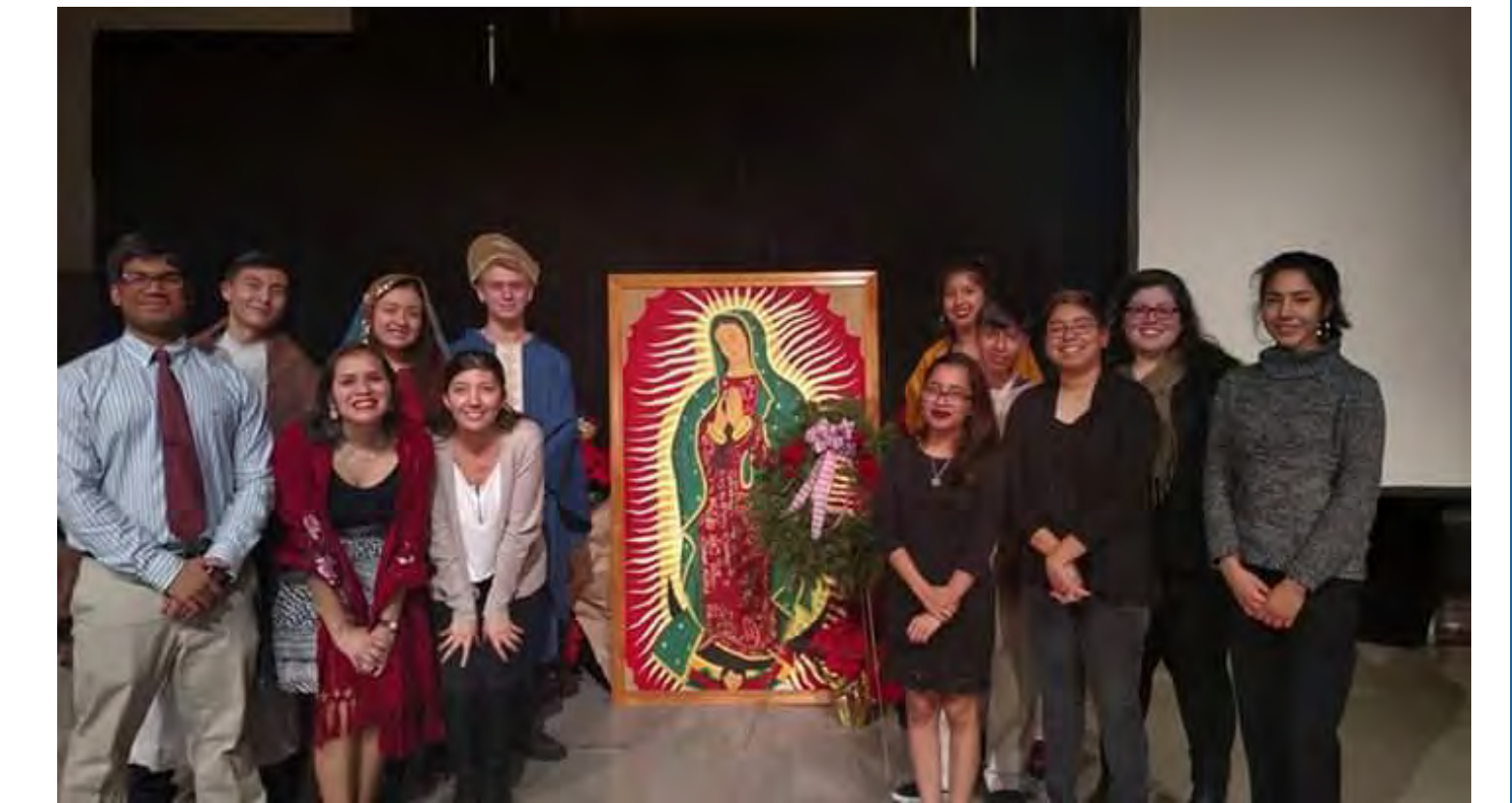
Cast of the play and LU members with La Virgen 10