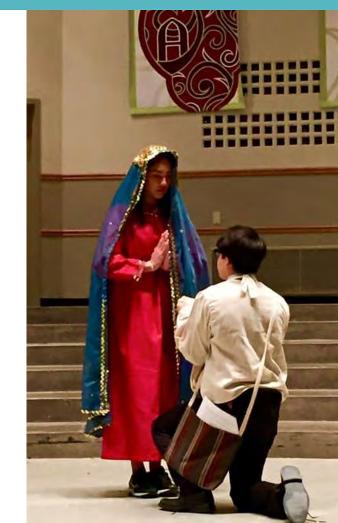
LU actors performing in the play. 7