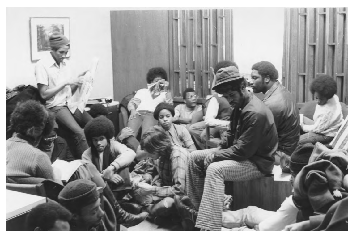
Black Student Union Sit-in in President Sorensen's office (1972). 3