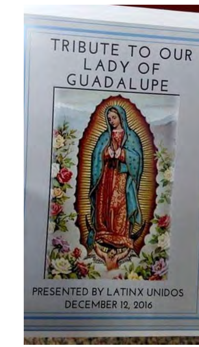
Program for the performance 9