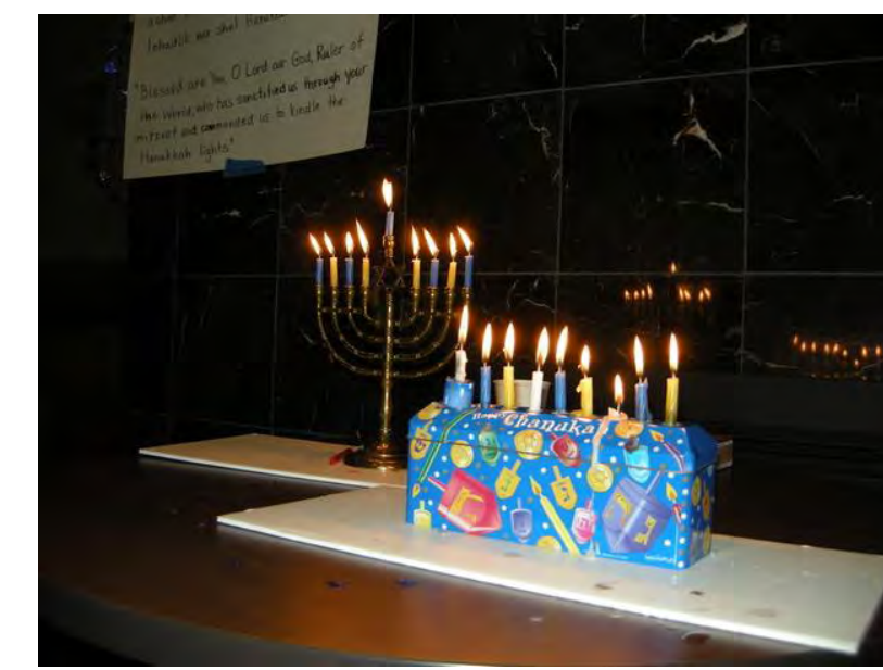
Menorah from the first ever Hanukkah at Augustana.