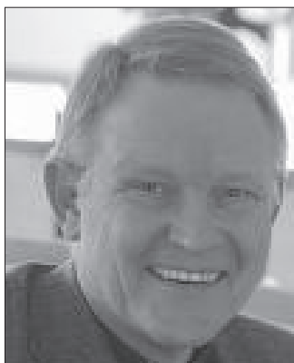
Archbishop Anders Wejryd of Sweden.