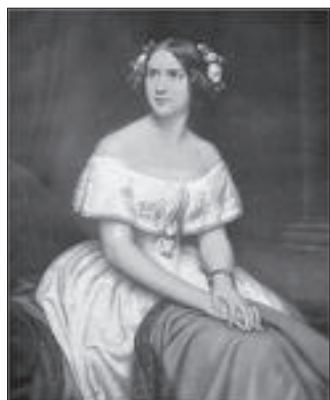
Jenny Lind, singer.

Web site: www.augustanaheritage.org E-mail (local contact): AHA@graceknoxville.org Phone (AHA at LSTC): 1-800-635-1116 ext. 712