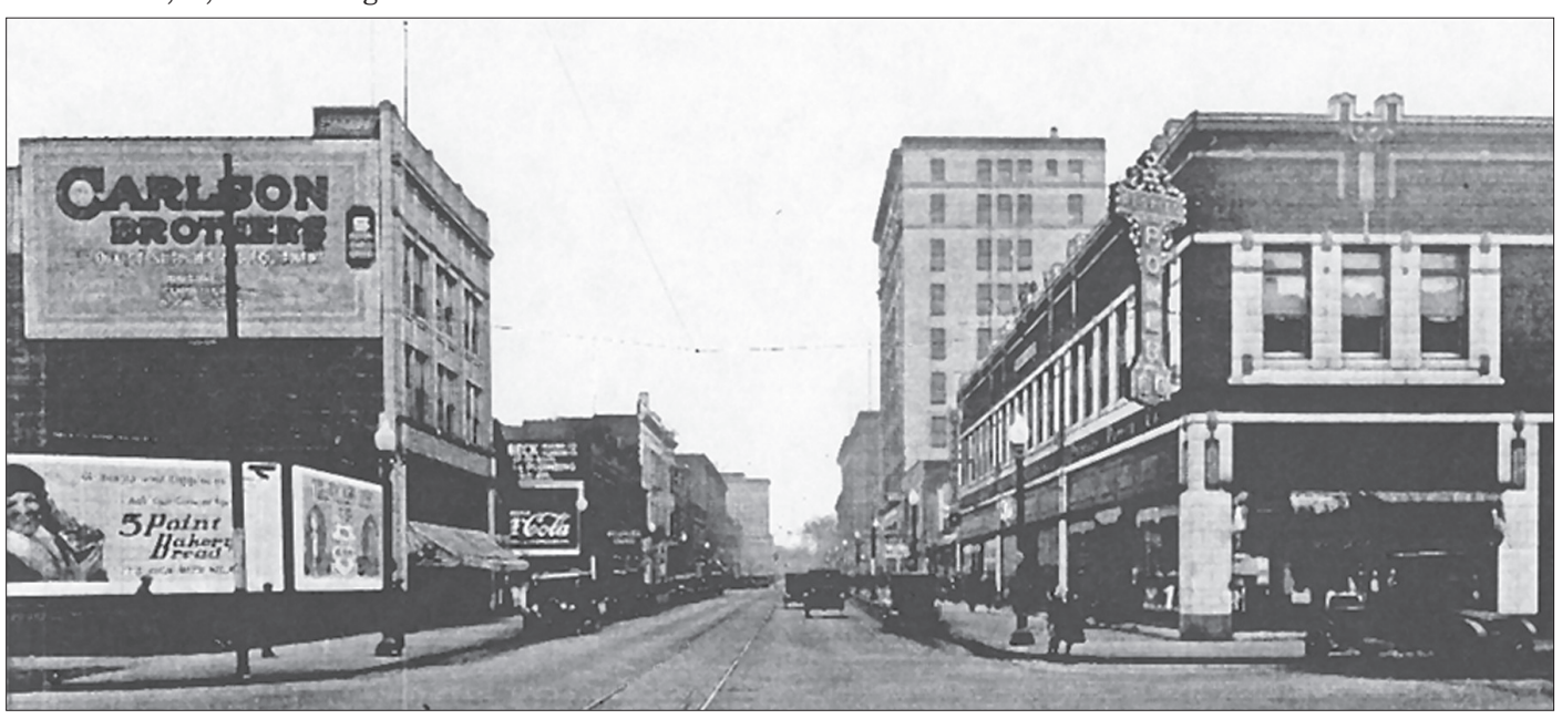
This 1920s view shows Fifth Avenue in Moline, looking east from 14th Street. In the right foreground is the 1912 Peoples Service Building, which was replaced by a bank parking lot in the 1960s. Peoples Power and its successor, Iowa-Illinois Gas and Electric Company, had offices in the building over its entire history. Behind it is the 1918 eight-story bank building on the corner of 15th Street. In the left foreground is the 1922 Carbro Building, which housed Carlson Brothers office supply for decades. The first streetcar connection between Moline and Rock Island ran along 3rd Avenue (now River Drive), but by the time of this photo, the main line came into downtown Moline along Fifth Avenue.