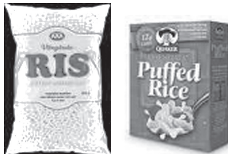
Swedish and American puffed rice.