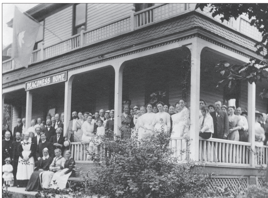
Exterior view of the Immanuel Deaconess Institute, Omaha (Neb.). Group portrait of approximately 100 people standing on the porch, sitting on the entrance steps, and sitting on a bench next to the left of the steps. Undated.