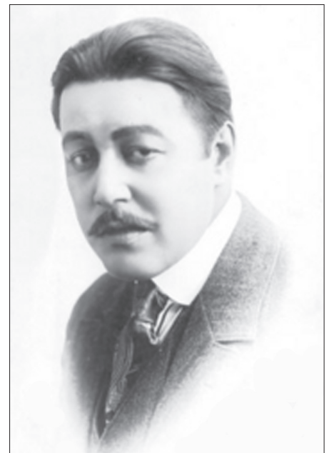
Warner Oland 1879-1938.