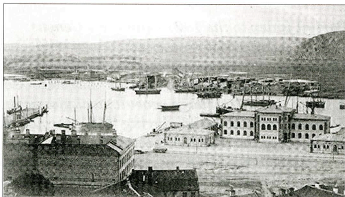
To the right in this picture is the Tullhuset (Customs House), where the new House of Emigrants is based.

The web site is still under construction and the e-mail address also.