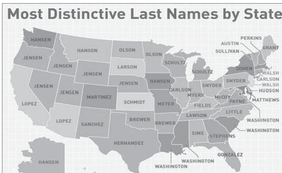
These statistics are compiled from the Social Security Death Master File. There is a link on p. 26 that explains more about this map.