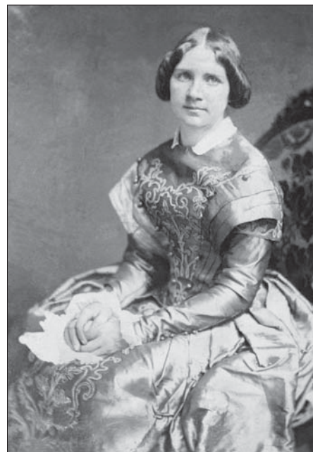
Jenny Lind 1850 in New York. Dauguerrotype by Swedish photographer Polycarpus von Schneidau.

Although she refused all requests to appear in opera after her return to Europe, Jenny Lind continued to perform in the concert halls. In 1856 she sang the chief soprano part in the first English performance of the cantata Paradise and the Peri by Robert Schumann. In 1866, she gave a concert with Arthur Sullivan at St James’s Hall. The Times reported, “there is magic still in that voice ... the most perfect singing – perfect alike in expression and in