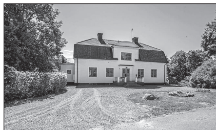
Södra Freberga in Kälvsten (now Västra Stenby), Östergötland.

What seems to be a little unusual are the many kinds of money that are listed in the inventory. He has many different kinds of coins in huge numbers, some even in the attic. As he was the tax collector, one wonders a little?