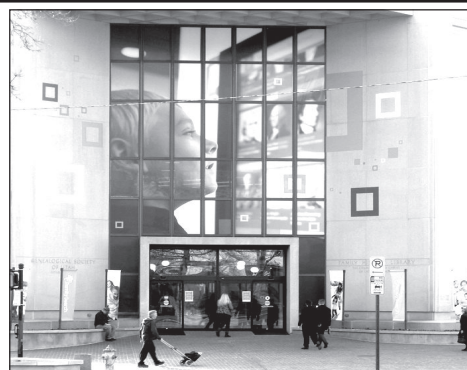
The Family History Library.

The SAG Workshop is the highlight of the year – a fun learning experience and a chance to do your Swedish genealogy with hands-on help from experienced Swedish and American genealogists.