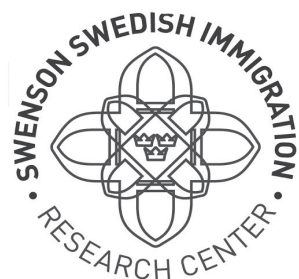
The Swenson Center logo!